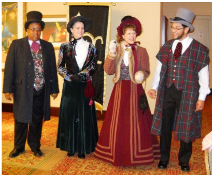
The Dickens Carolers performed Christmas and

We are missing three of the WOW orange and yellow striped "worker" aprons from the