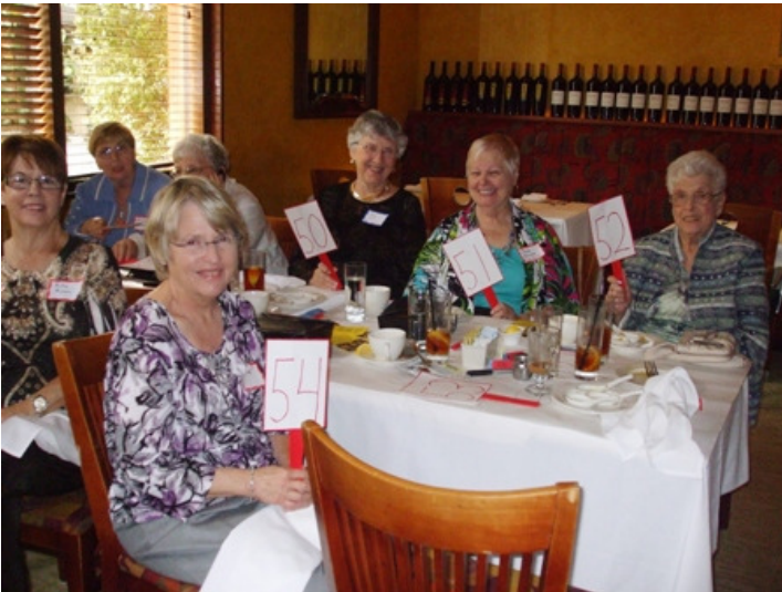
White Elephant Charity Auction 2013

Send in your reservation for the February luncheon today! It will be good food and good fun.