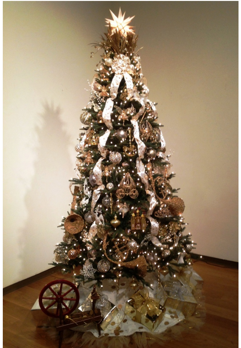
WOW's beautiful Tree for the 2015 Festival of Trees